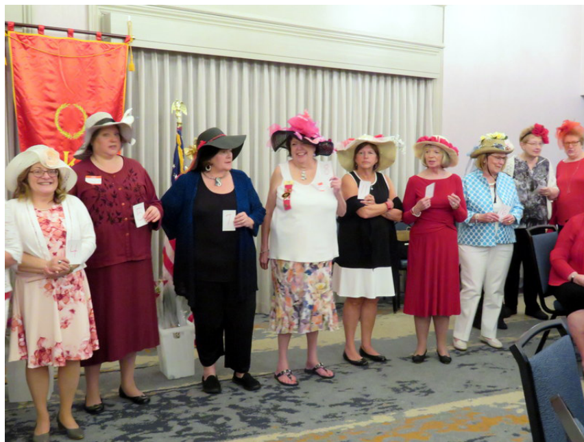
Kentucky Derby Hat Parade