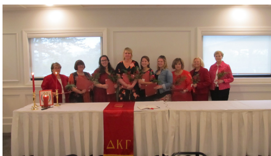
2018 Initiates to Eta Chapter