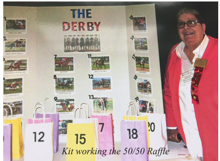
Kit working the 50/50 Raffle