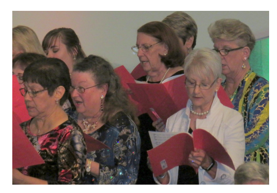
150 members made up the chorus.

Be Progressive. Keep up with the moving world while not discarding what in the old has value. But, don't cling to the old when its worth has passed.