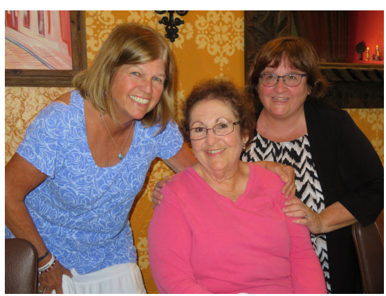
MA State Dinner at Uncle Julio's