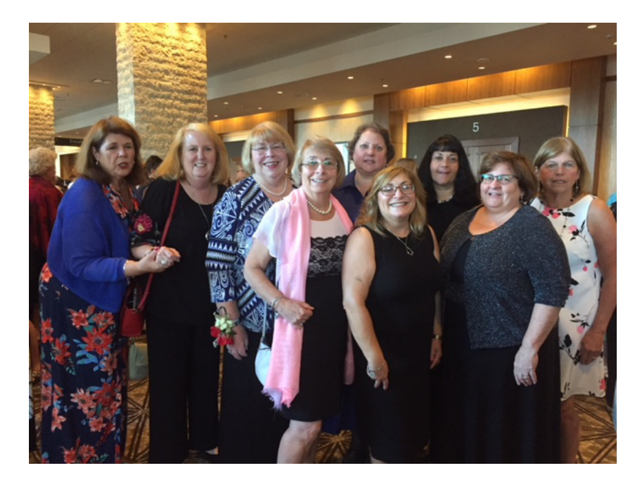
Reception and Celebration Banquet