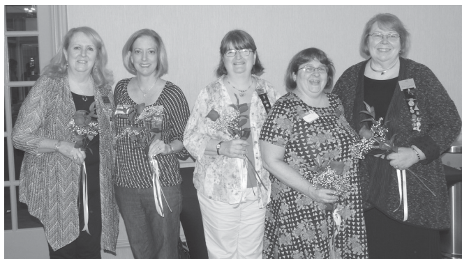
2017 Biennium New Officers